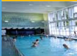
Mills-Peninsula MC San Mateo, CA