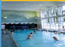
Mills-Peninsula MC San Mateo, CA