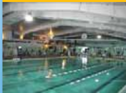
USA Swimming Colorado Springs, CO