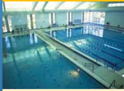
Lakeshore Foundation Birmingham, AL